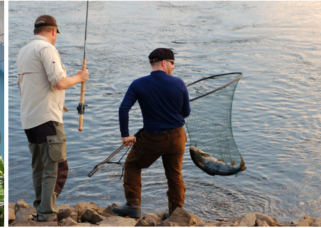
You'll find one of Sweden's best fishing experiences for salmon and trout in Ångermanälven.