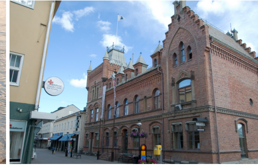
Sollefteå museum and library is housed in a beautiful building from 1880 designed by architect Lars Niklas Wahrgren.